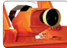
Multi speed gearbox for 540 & 1000 RPM PTO