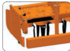
Rear leveling bar with screw adjustment