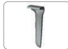
Blades with 12 mm/ 0.47 inch thickness and 285 mm/11.22 inch length made of boron steel material