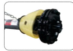
Universal joint power transmission shaft with clutch