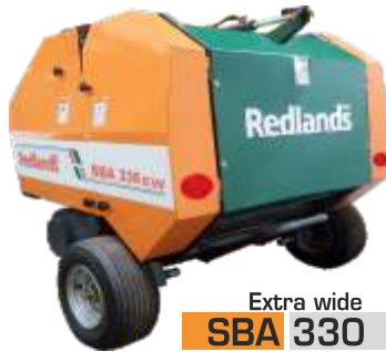
Extra wide SBA 330